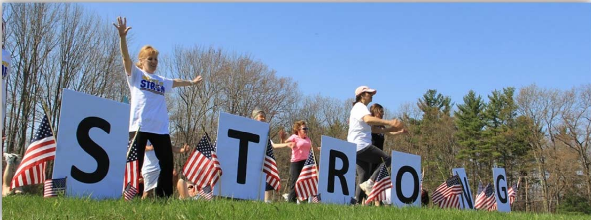
PlaistowAccess coverage of "Boston Strong" Event

We have continued to record and broadcast many annual events throughout town, in 2013: